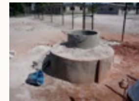
FUEL Youth community well and water system