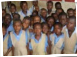
GSA YMCA School, Paynesville