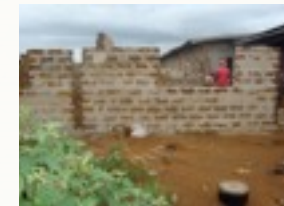
The children were delighted to show me the work for their new kitchen that will soon be completed.