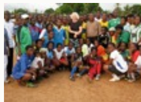
The girls who are training for a match in Europe posed with me after practice.