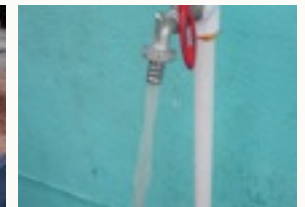
Completion of the water system and running water