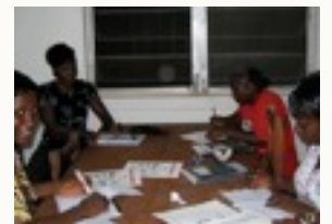
At the MEF workshop teachers are using local materials to make games.