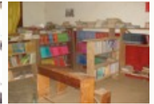
African Children's Library Project, Nengbeh, Nimba