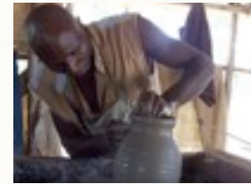
Potter with Liberian Potters' Association, Monrovia

The organization will facilitate "Literate Liberia Movement" by providing transportation for organizers, community leaders and school personnel as well as materials and supplies to students in grades 7-12 who will teach reading and writing to some 3,000 people in the Monrovia area, including at neighborhoods and in market places.