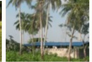
Kakata Rural Teacher Training Institute (KRTTI) Farm Project