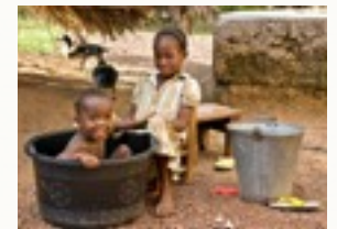
Liberian children enjoying bath time