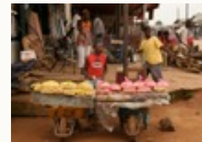
Resourceful business men in Ganta, Nimba

The association will purchase a kiln and related materials to enable a group of potters to become self-sustaining by training more potters, providing production access for more potters and developing marketing strategies.