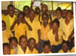
Children of Nimba

Donations to honor the memory of loved ones can be made the same as other donations. We will memorialize these people on our website so that others may know of their passing.