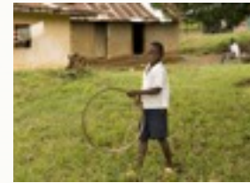
Small boy with his own created toy

The association will train women to reestablish the production of country cloth, including weaving, tailoring, needle work, design and sales.